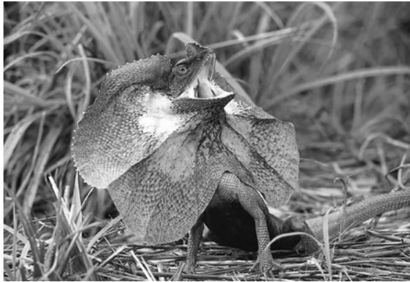
Magnification \times 0.1

Male frilled lizards display their frill to attract females. A successful male may mate with many females.