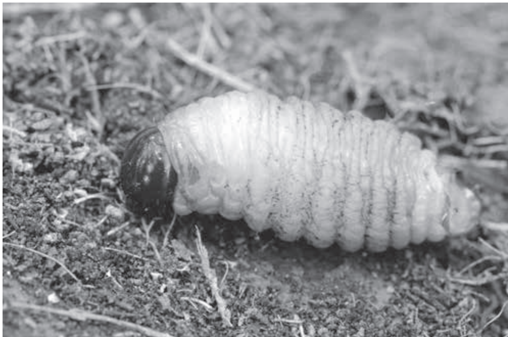
Magnification \times 10

The photograph below shows a larva of R. ferrugineus .