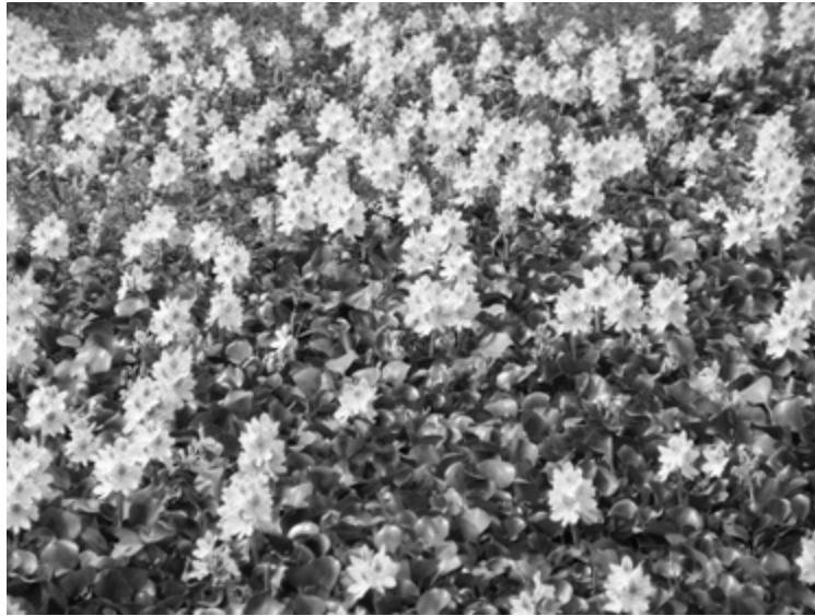
Magnification \times 0.1

In the production of glucose, cellulose from water hyacinths is mixed with the enzyme cellulase. Cellulase breaks down the cellulose to produce glucose.